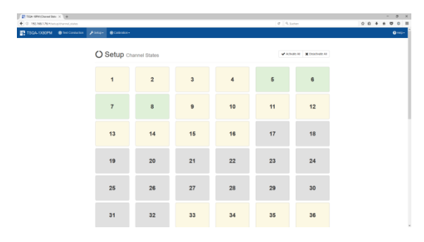
Figure shows Setup Menu of the web-interface

Using the web-interface allows the remote operation of the system without any additional effort of application software development and regardless of a remote location.